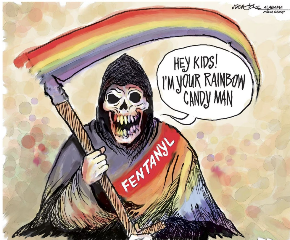
Rainbow Reaper from AL.com 9/14/22